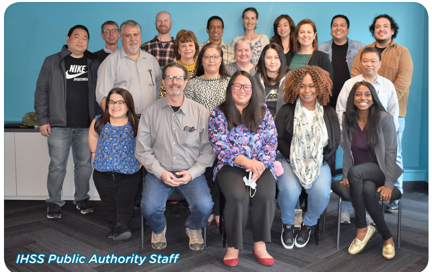
IHSS Public Authority Staff

The mission of San Francisco's IHSS Public Authority is to provide and promote a service delivery model of consumer directed, in-home support that maximizes the potential of older adults and people with disabilities to live independently and participate in their communities.